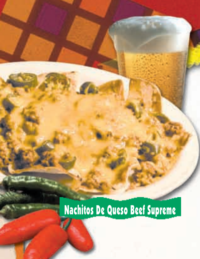
Nachitos De Queso Beef Supreme